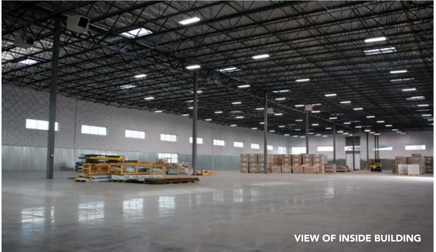
VIEW OF INSIDE BUILDING