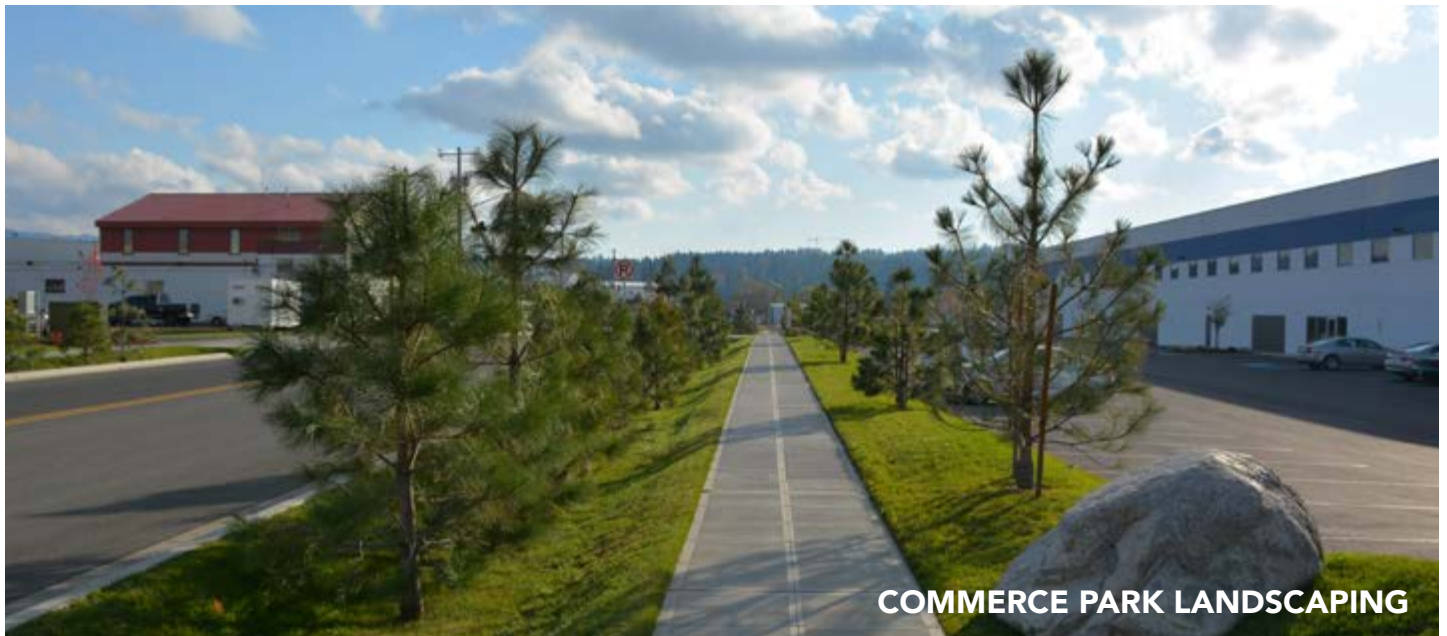
COMMERCE PARK LANDSCAPING