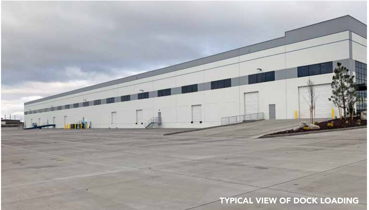
TYPICAL VIEW OF DOCK LOADING

OFFICE: Rates to be determined by tenant's specifications