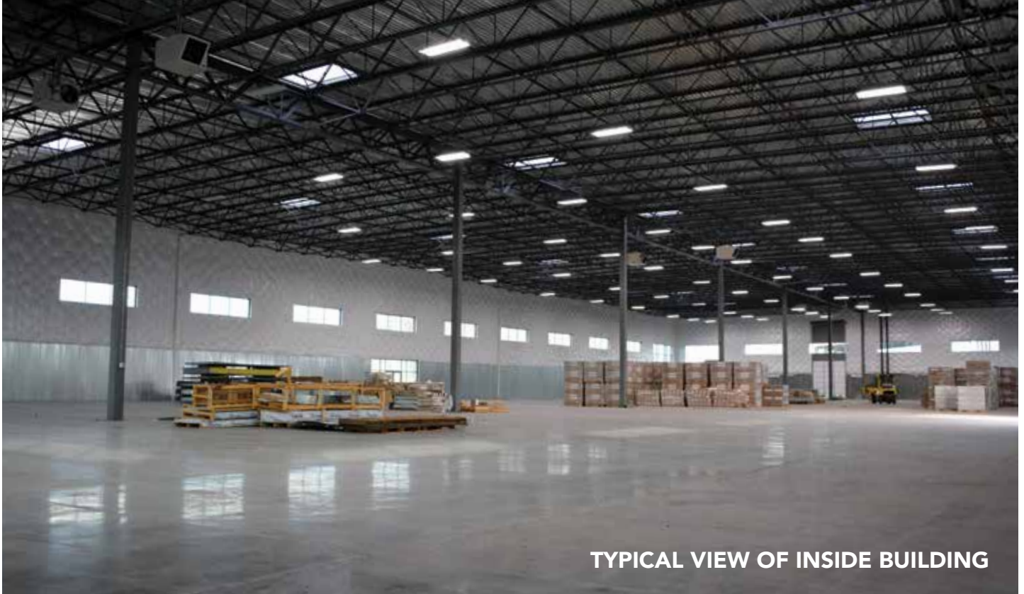
TYPICAL VIEW OF INSIDE BUILDING