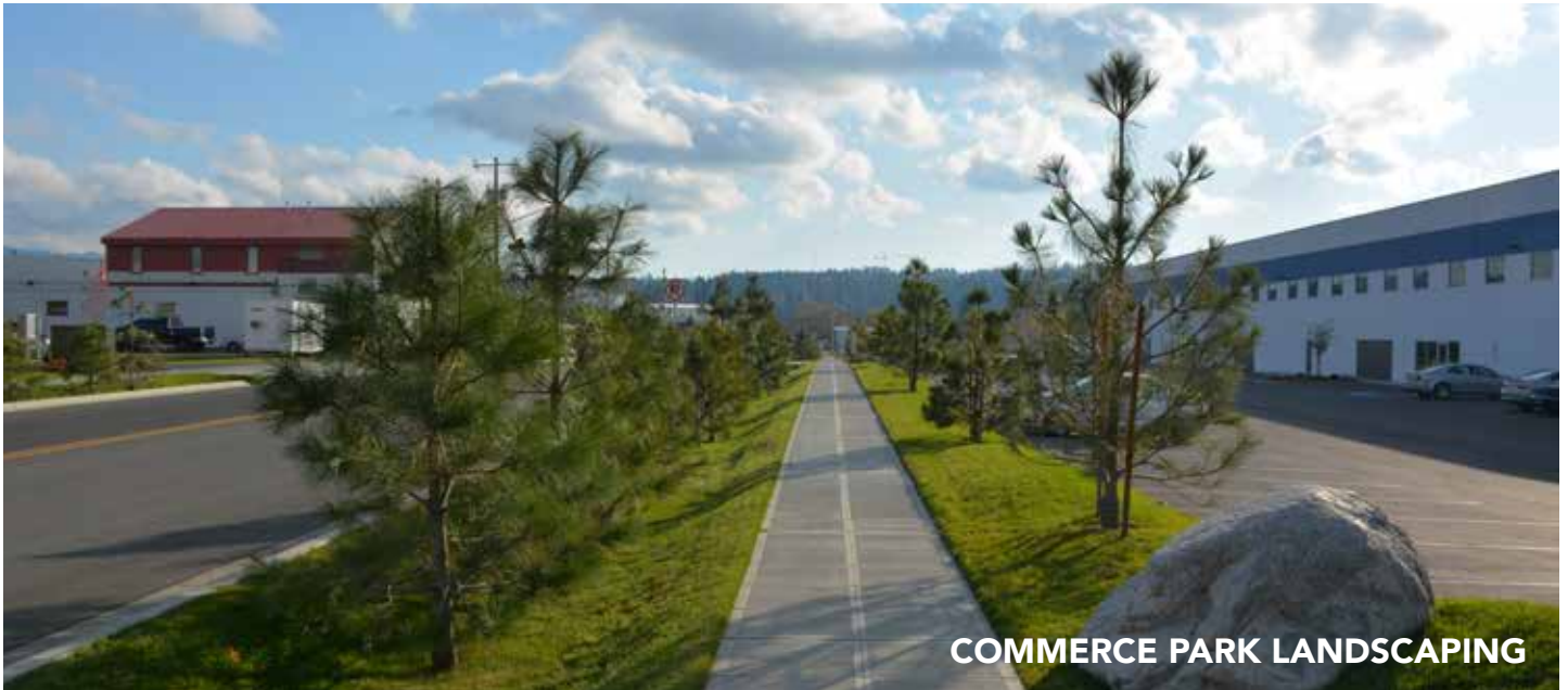
COMMERCE PARK LANDSCAPING