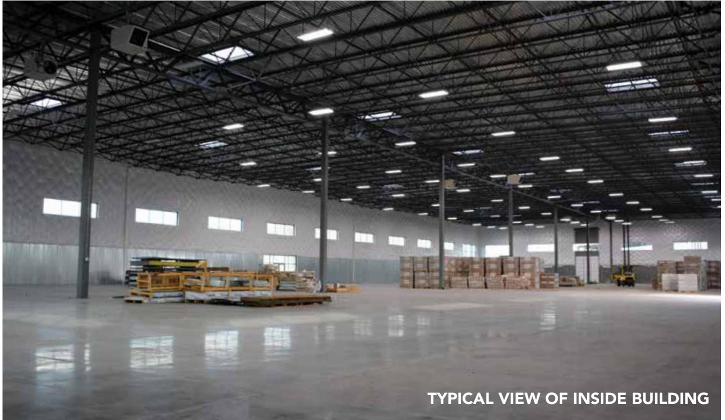
TYPICAL VIEW OF INSIDE BUILDING