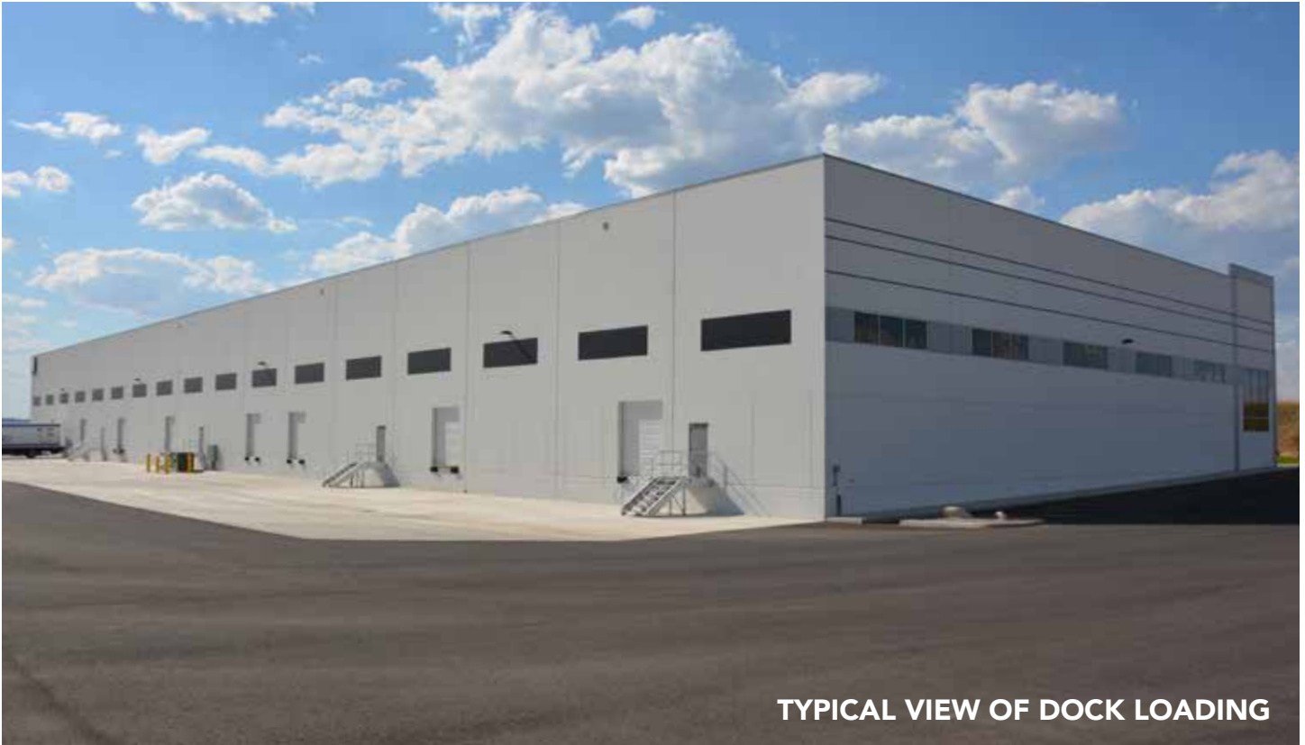
TYPICAL VIEW OF DOCK LOADING

OFFICE: Rates to be determined by tenants specifications